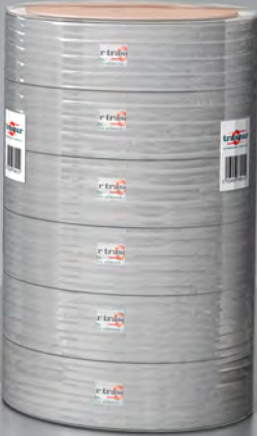
3X120° BUNDLE LABELED SYSTEM