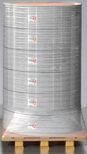
ON WOODEN PALLET