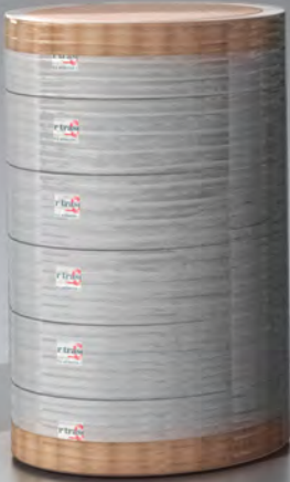
WITH FOLDED CARDBOARD HEADERS