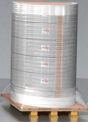
DOUBLE WRAP WITH STRIP