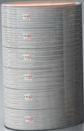
WITH SIMPLE CARDBOARD HEADERS